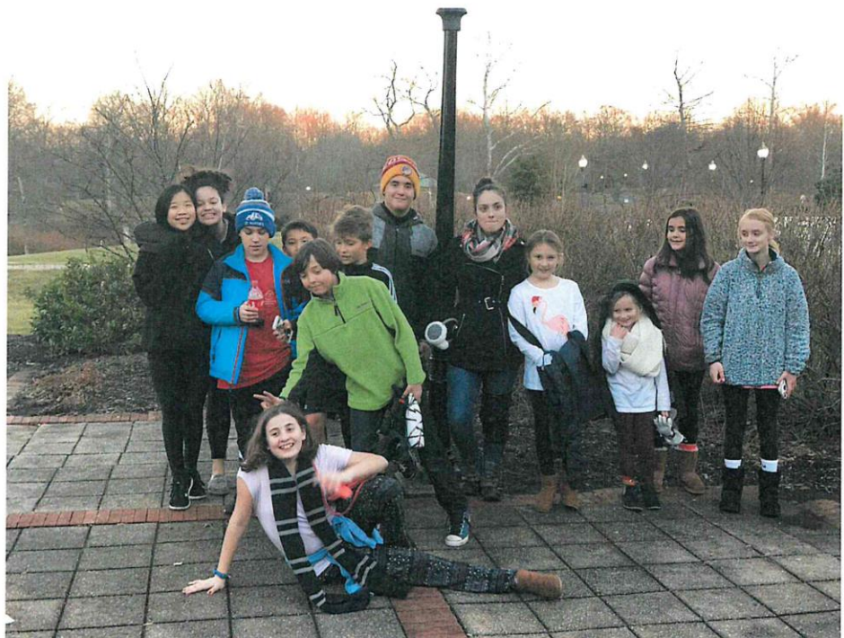
Celebrating God's seasons with ice skating and fellowship!