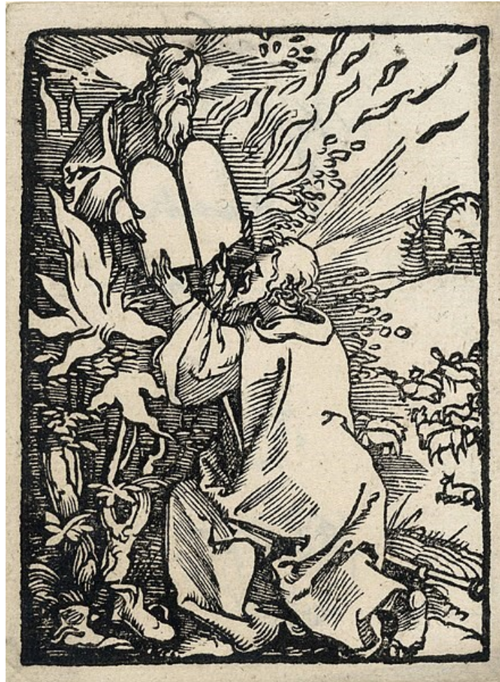
Moses Receiving the Ten Commandments (from Luther's Prayer Book) Hans Sebald Beham (1500-1550)

SAINT MARTIN'S EVANGELICAL LUTHERAN CHURCH Annapolis, Maryland